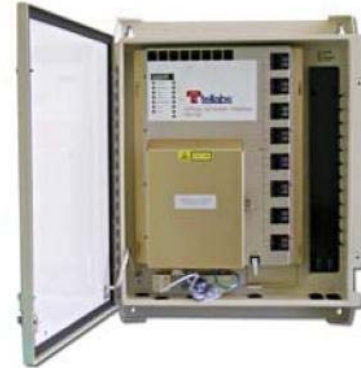
Tellabs 1600 - MDU ONT's

They now have options - The new Motorola & Tellabs ONT product line not only brings new service and installation features to the SFH (Single Family Home) , but have created a very robust MDU ONT product line. Some of the major technology advancements are MoCA (short for Multimedia over Coaxial Alliance) , this technology allows for delivery of data over Cat5 (Ethernet) or existing in-home coaxial cable , this is a major advancement for the field technician installation. This will allow for the technician to scale back there installation time dramatically using the existing in-home coax cable. The next major advancement has been with creating an ONT that will distribute the triple play service via VDSL w/ POTS. The Motorola MDU ONT has a unique counterpart to this feature with their RG (Residential Gateway) which is in the form of a set-top box. Here's a brief description of the new ONT's along with the services they offer.