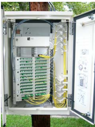
Fiber Distribution Hub

ONT - Optical Network Terminal , this is the CPE (Customer Premise Equipment) endpoint of the ODN. The ONT is an Optical to Electrical to Optical device, that delivers your triple play services. It will replace your existing copper NID (Network Interface Device) and your existing coax; POTS services will be cross-connected to it. Since we understand that a PON is completely passive the endpoint must obtain an AC voltage.