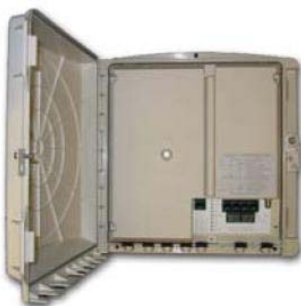
Tellabs 1600 - SFH ONT Series

Visit the following link http://communities.verizon.com