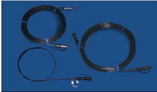
Pre-terminated Drop Cables